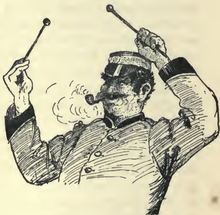
THE BANDMASTER OF "THE SONS OF LIBERTY"

Almost as I arrived a pistol-shot set the echoes clattering round the lake, and three boats burst out abreast from the throng into the open water. Two of the crews were in shirt-sleeves, the third wore the green jerseys of the football club; the boats were of the heavy sea-going build, and pulled six oars apiece, oars of which the looms were scarcely narrower than the blades, and were, of the two, but a